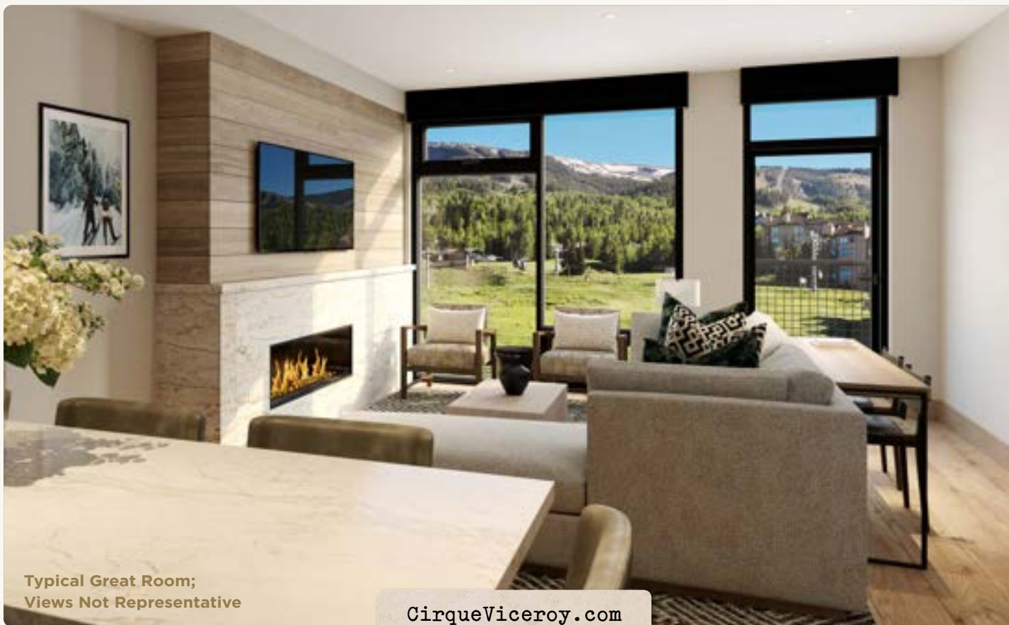
Typical Great Room; Views Not Representative