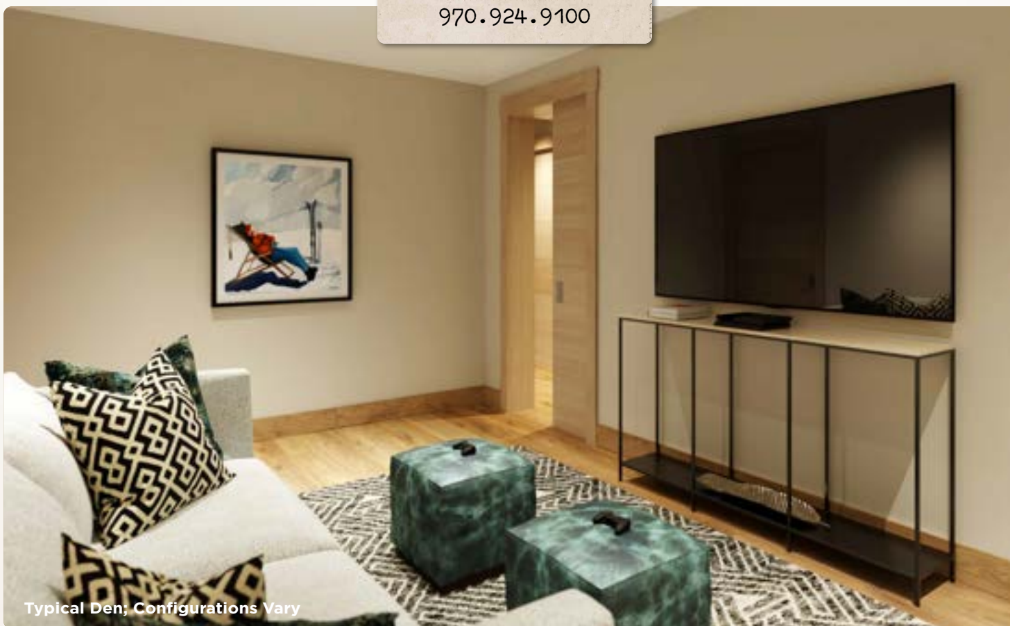
Typical Den; Configurations Vary

Residence images are artist conceptual renderings intended solely for illustrative purposes and may not accurately represent the details of this specific residence. The specific orientation, views, window configurations, furniture, features, ceiling heights and design elements vary from home-to-home and are subject to change. Full project plans and specifications which contain all the design details of each home are available for review upon request. Square footages are approximated using the architectural method and based on architectural plans and subject to change. All residences sold furnished. Presented by Slifer Smith & Frampton Real Estate.