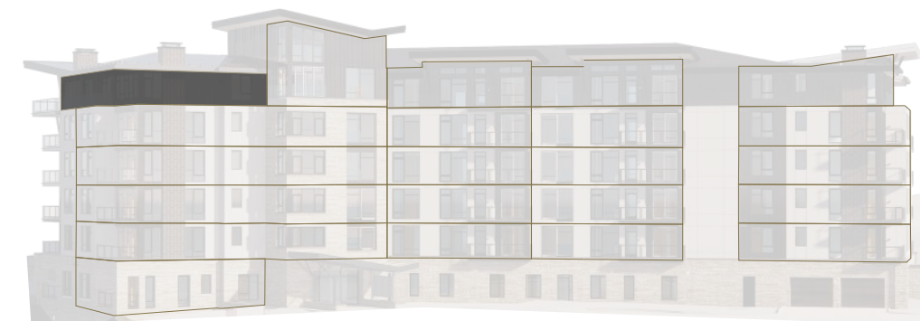
Viceroy Resort Side