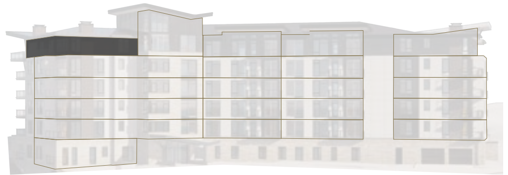
Viceroy Resort Side