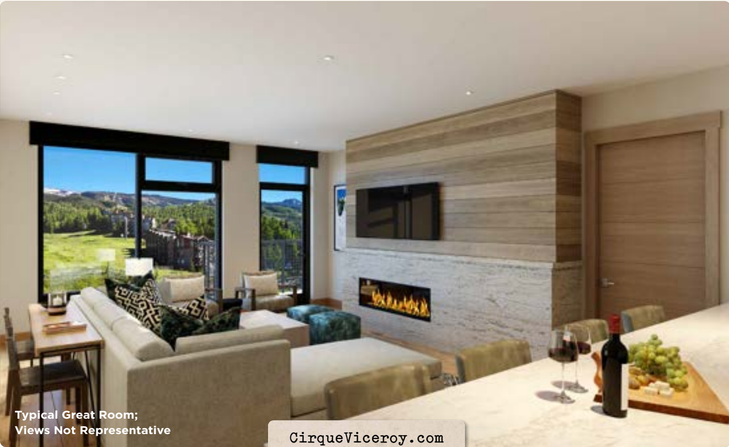
Typical Great Room; Views Not Representative