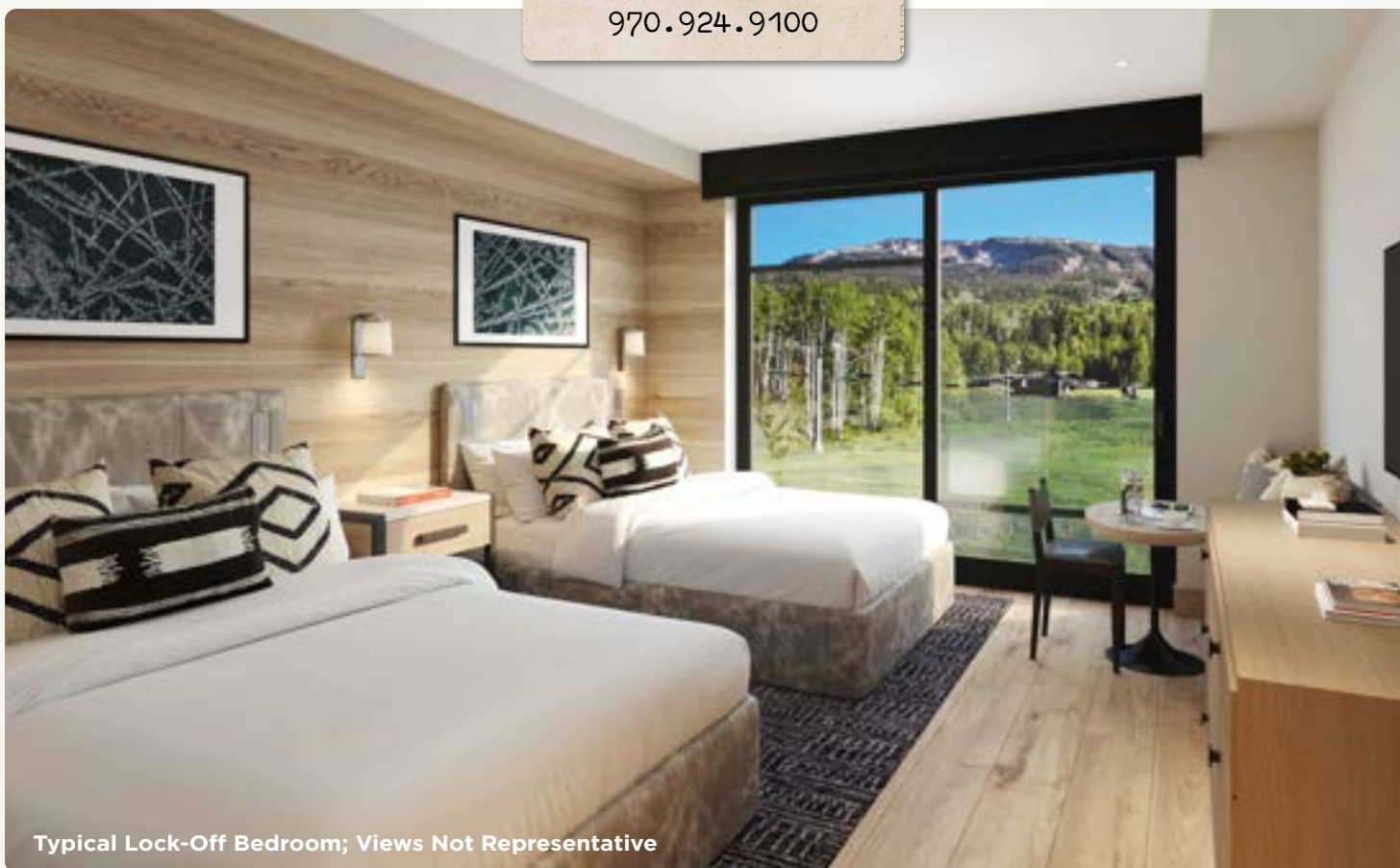
Typical Lock-Off Bedroom; Views Not Representative

Residence images are artist conceptual renderings intended solely for illustrative purposes and may not accurately represent the details of this specific residence. The specific orientation, views, window configurations, furniture, features, ceiling heights and design elements vary from home-to-home and are subject to change. Full project plans and specifications which contain all the design details of each home are available for review upon request. Square footages are approximated using the architectural method and based on architectural plans and subject to change. All residences sold furnished. Presented by Slifer Smith & Frampton Real Estate.