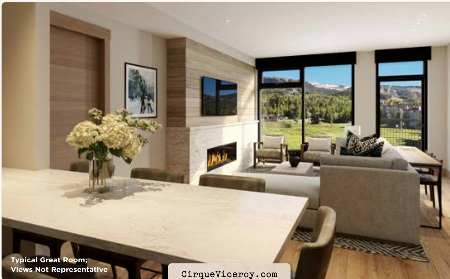
Typical Great Room; Views Not Representative