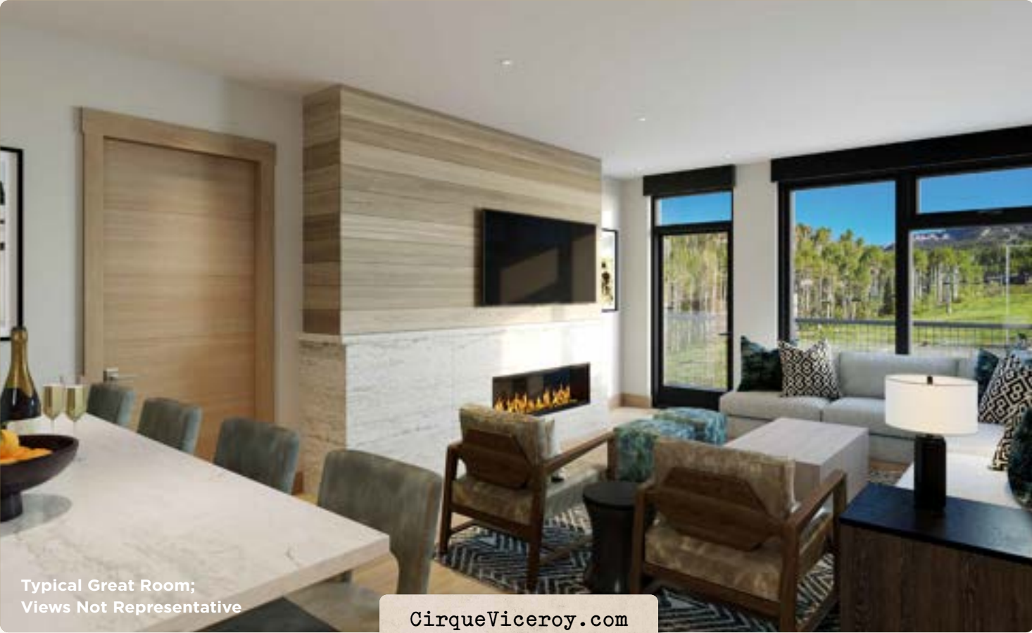
Typical Great Room; Views Not Representative