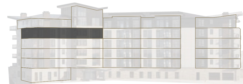
Viceroy Resort Side