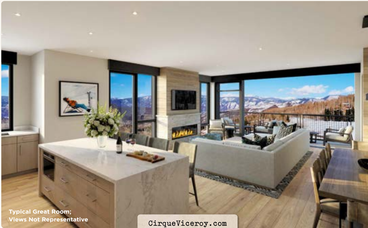
Typical Great Room; Views Not Representative