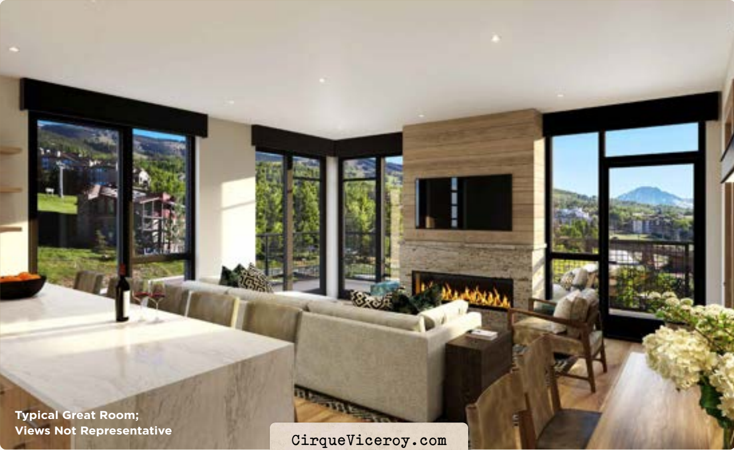
Typical Great Room; Views Not Representative