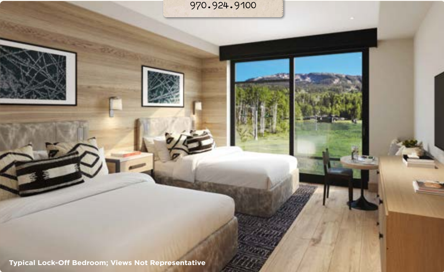
Typical Lock-Off Bedroom; Views Not Representative

Residence images are artist conceptual renderings intended solely for illustrative purposes and may not accurately represent the details of this specific residence. The specific orientation, views, window configurations, furniture, features, ceiling heights and design elements vary from home-to-home and are subject to change. Full project plans and specifications which contain all the design details of each home are available for review upon request. Square footages are approximated using the architectural method and based on architectural plans and subject to change. All residences sold furnished. Presented by Slifer Smith & Frampton Real Estate.