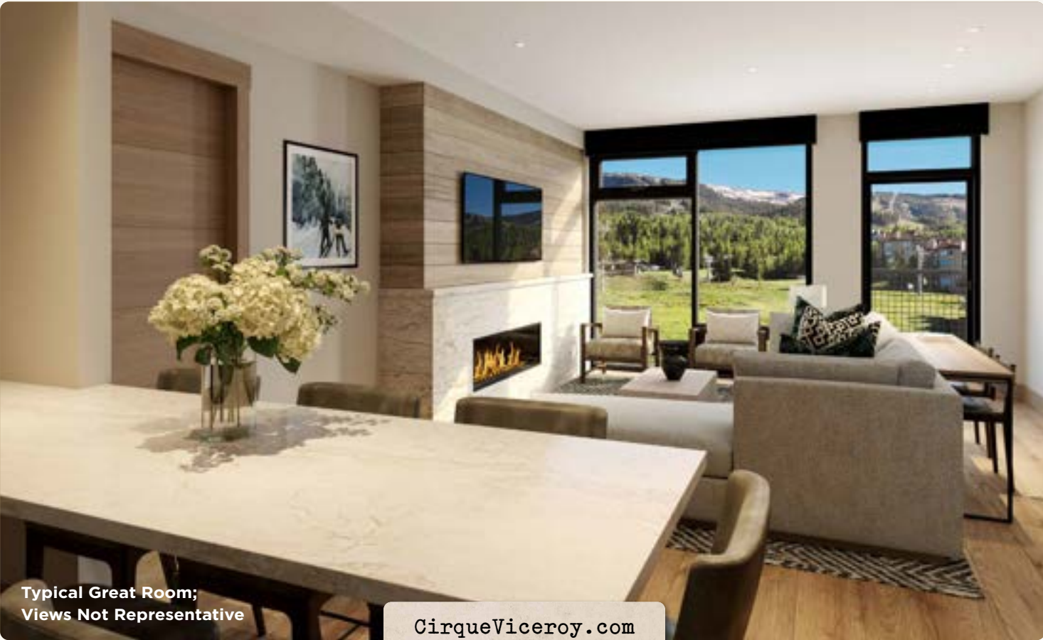
Typical Great Room; Views Not Representative