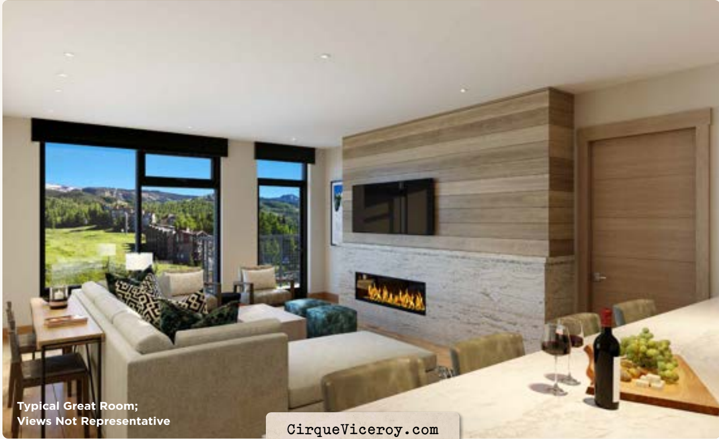
Typical Great Room; Views Not Representative