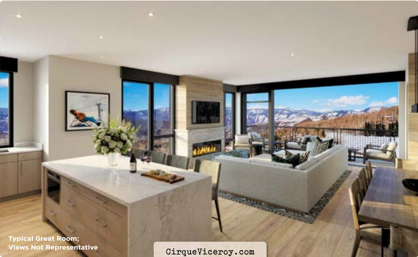
Typical Great Room; Views Not Representative