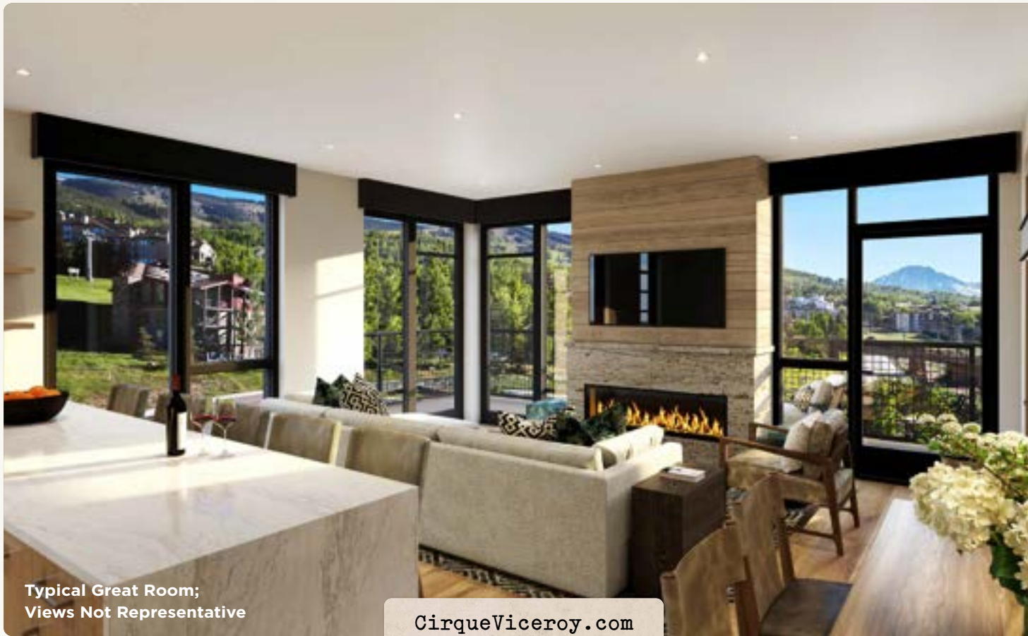
Typical Great Room; Views Not Representative