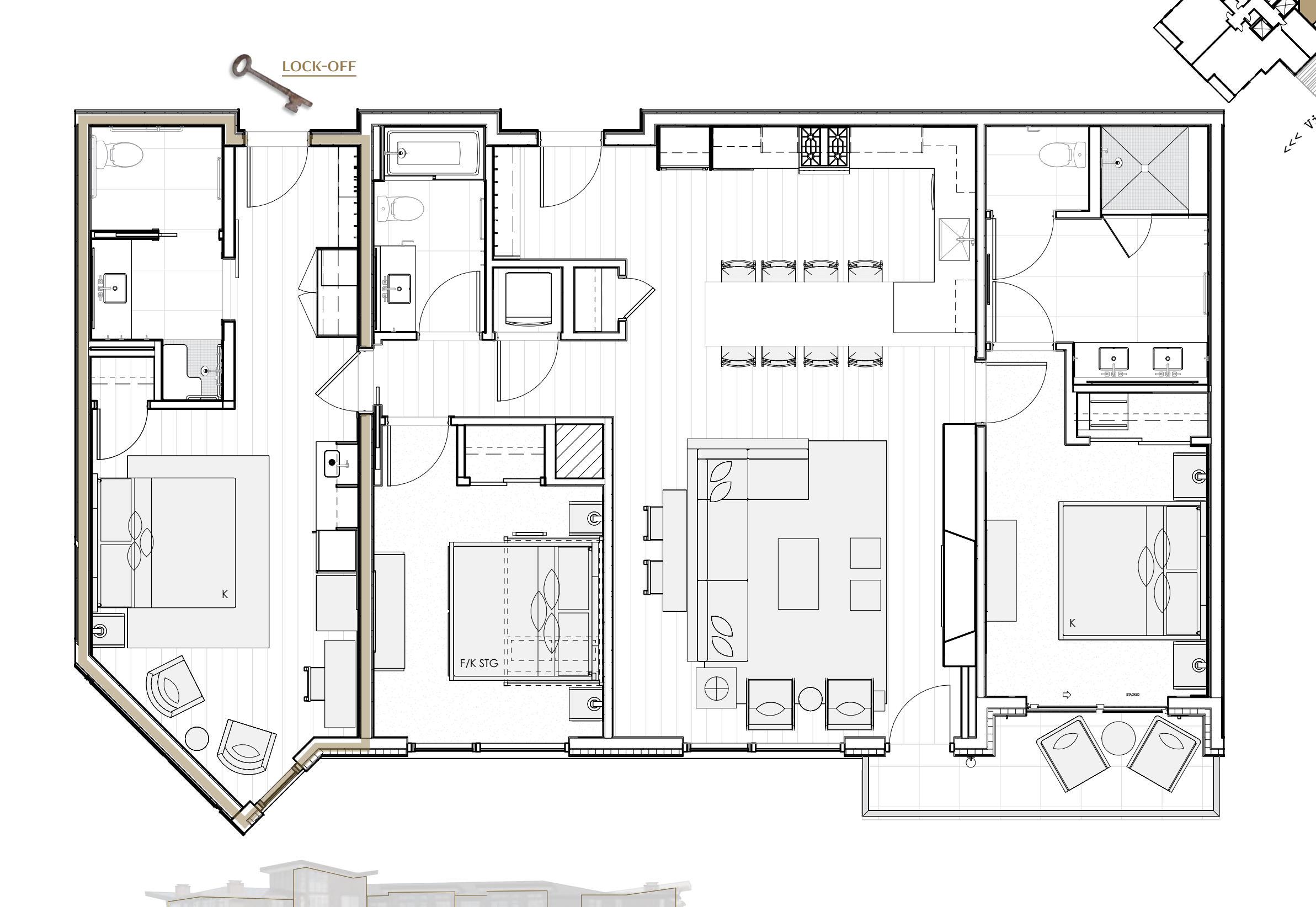
Viceroy Resort Side