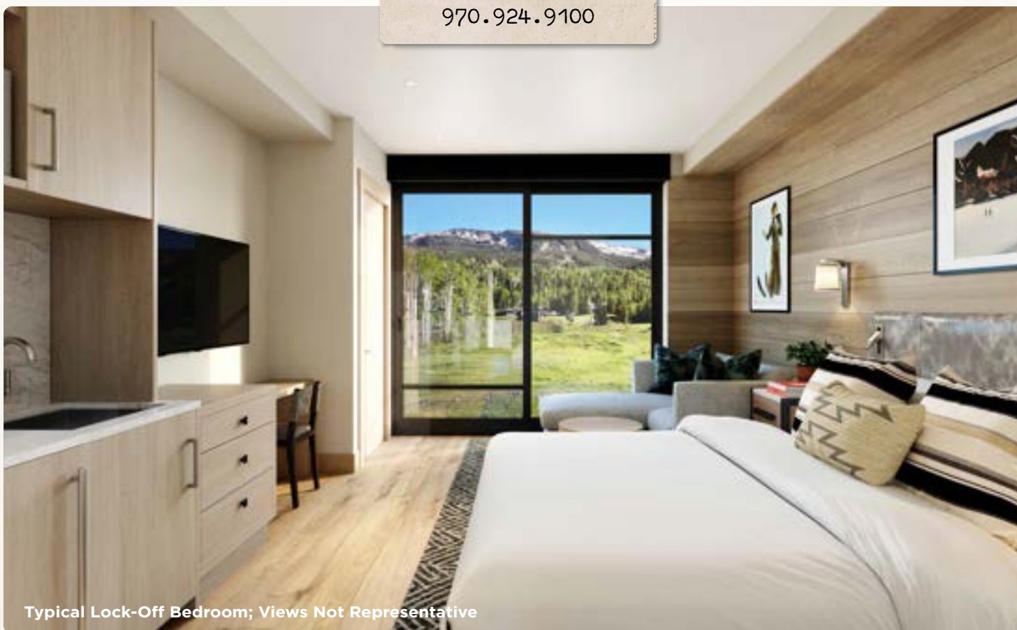
Typical Lock-Off Bedroom; Views Not Representative

Residence images are artist conceptual renderings intended solely for illustrative purposes and may not accurately represent the details of this specific residence. The specific orientation, views, window configurations, furniture, features, ceiling heights and design elements vary from home-to-home and are subject to change. Full project plans and specifications which contain all the design details of each home are available for review upon request. Square footages are approximated using the architectural method and based on architectural plans and subject to change. All residences sold furnished. Presented by Slifer Smith & Frampton Real Estate.