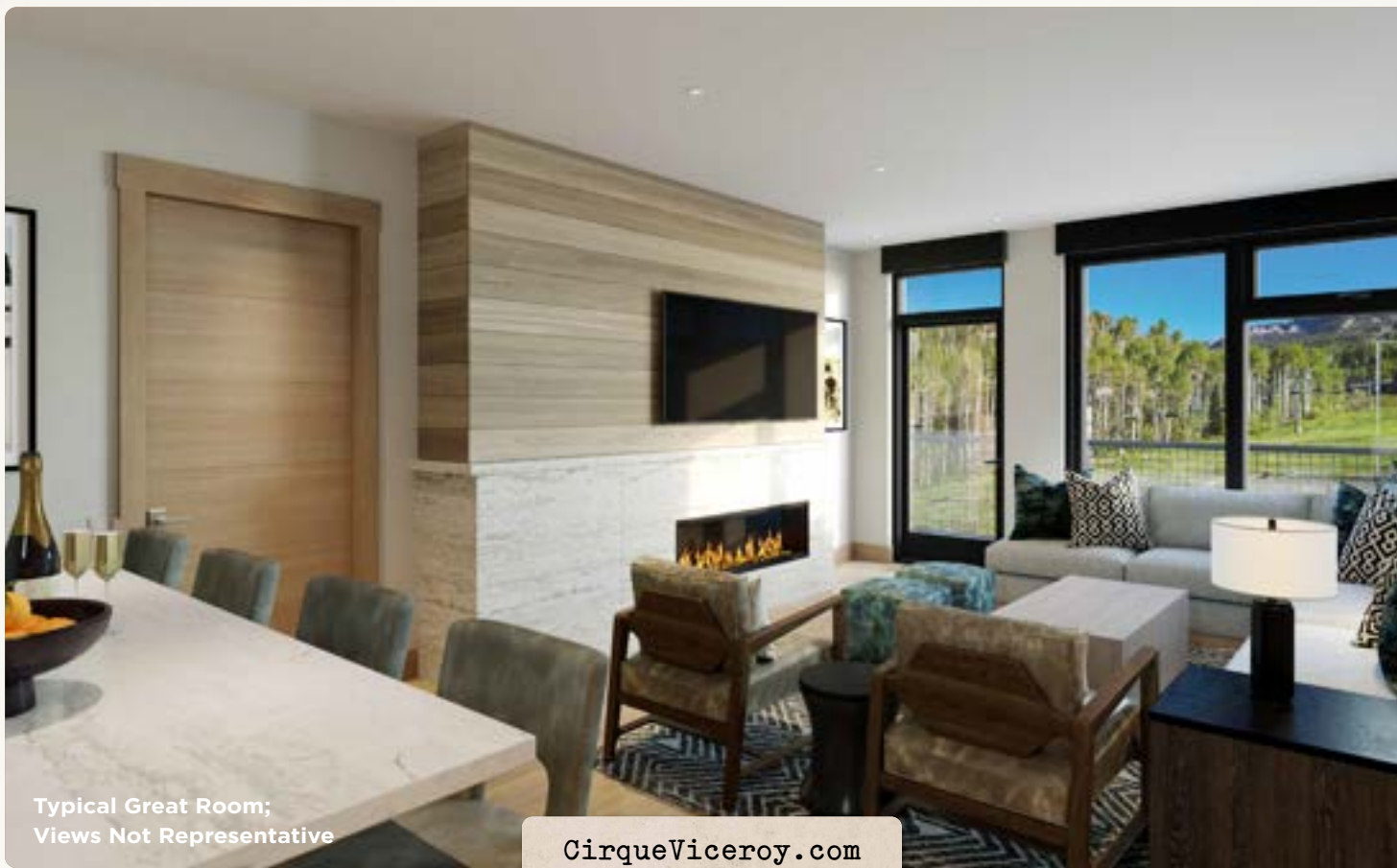
Typical Great Room; Views Not Representative