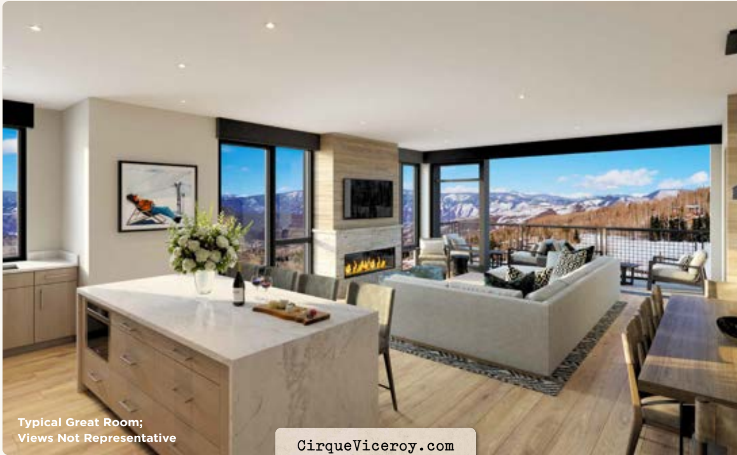
Typical Great Room; Views Not Representative